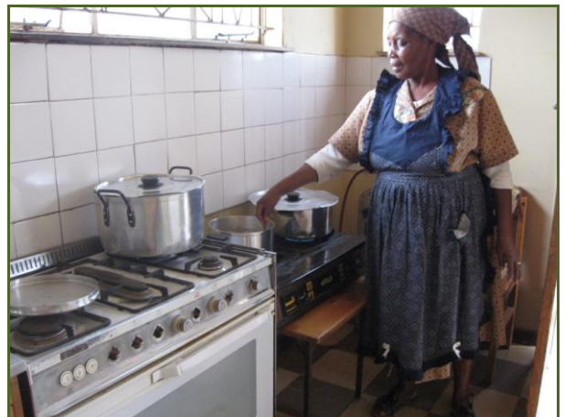
Figure 4 Gas stoves used for preparation of meals for workshops, trainings and meetings held at the Centre