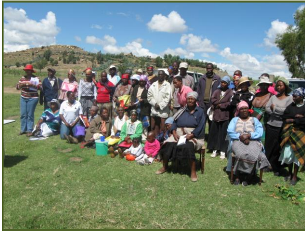
Figure 1 SGP Team, Local HIV/AIDS Support Groups, PAVA Staff and ASB (partner NGO) during field appraisals