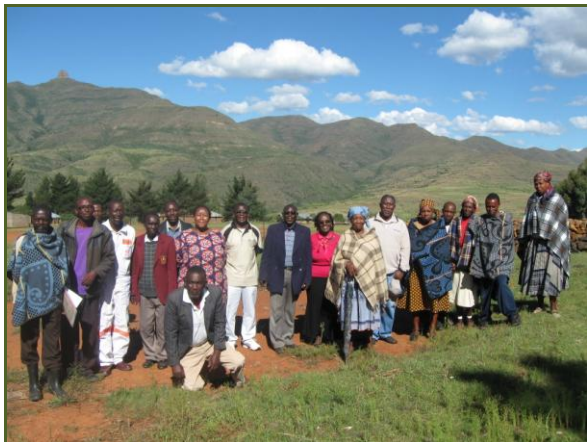
Figure 5 SGP Team, YWCA staff and representatives of Makhalaneng Community with a section of the area for aloe plantation in the background