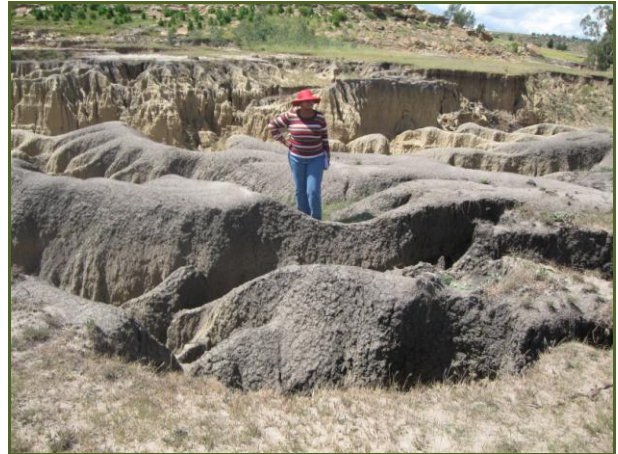
Figure 2 A section of the degraded land to be rehabilitated and put under bamboo plantation by PAVA