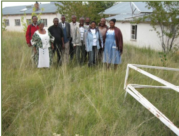
Figure 3 SGP Team and MTCDT Board Members with Matelile Community Development Centre in the background