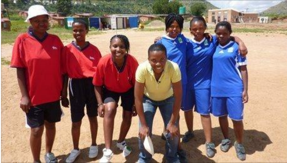
Girls are given football training to raise their self-esteem

Lesotho sits like pearl in a shell, surrounded by the land mass of South Africa. But this tiny kingdom of 1.8 million people boasts another jewel, which is perhaps astonishing given its size.